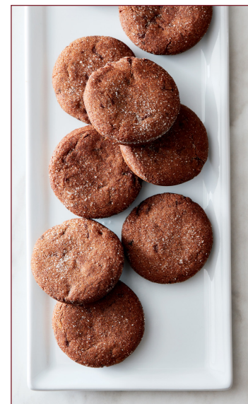
Photo courtesy of New England Today/Yankee Magazine (NewEngland.com). Photo by Mark Weinberg; styling by Maggie Ruggiero (food) & Caroline Woodward (props)

Bake for about 13 minutes, rotating the tins from top to bottom and front to back after 7 minutes. The cookies should be lightly set around the edges and softer in the center. Transfer to racks and let rest for 15 minutes before unmolding the cookies and placing them on racks to cool completely (if you're baking in batches, make sure the tins are cool before reusing). The cookies can be kept in a sealed container at room temperature for up to 4 days.